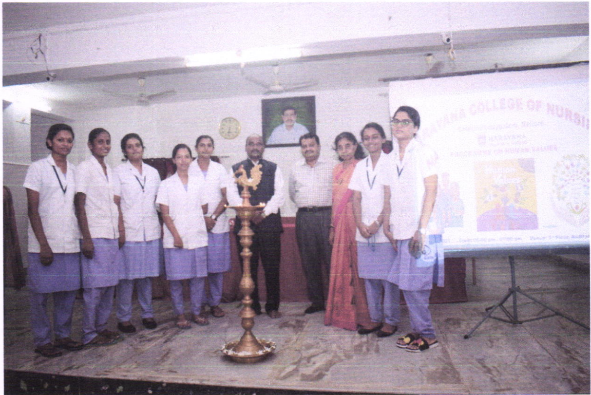
Figure 1: Speakers ,Principal and Students on Human Value Programme